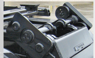
Dual Rear Rollers