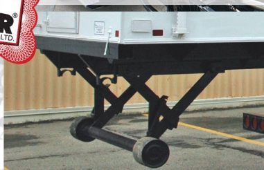
Drop Down Bumper