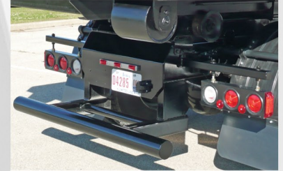
Rear Light Bar & Bumper