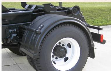
Single Axle - Poly Fender