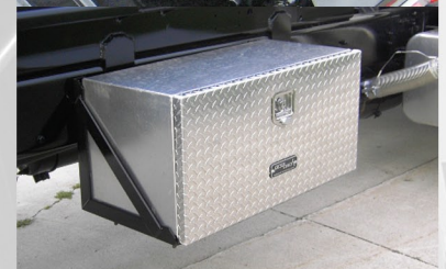
Aluminum Tool Box