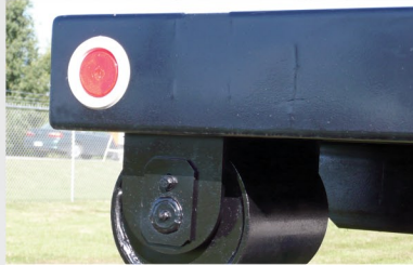
Rollers & Brackets