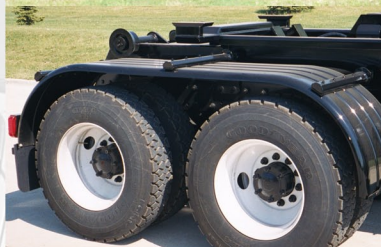
Tandem Axle - Steel Fender