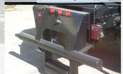
Stabilizer w/Rear Bumper